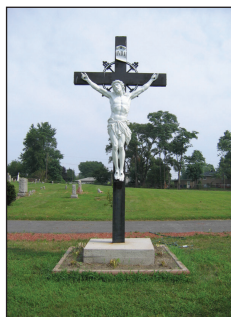
Ss. Peter & Paul Cemetery