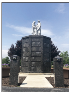
Saint John - Saint Joseph Cemetery