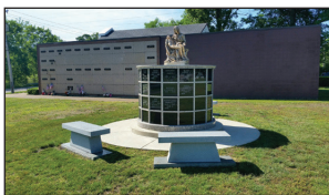
St. Stanislaus Cemetery