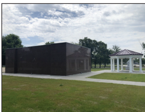
Saint John - Saint Joseph Cemetery