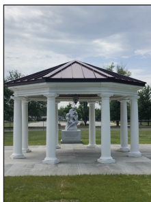
Saint John - Saint Joseph Cemetery