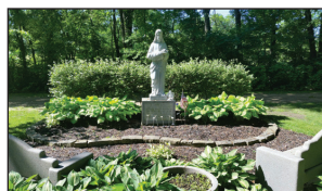
St. Stanislaus Cemetery