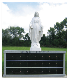
Ss. Peter & Paul Cemetery