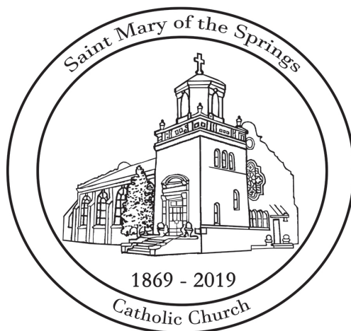
St. Mary of the Springs Church 150th Anniversary Year Calendar of Events