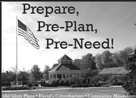
Old Glory Plaza • David's Columbarium • Community Mausoleum

Your community cemetery open to all faiths since 1826.